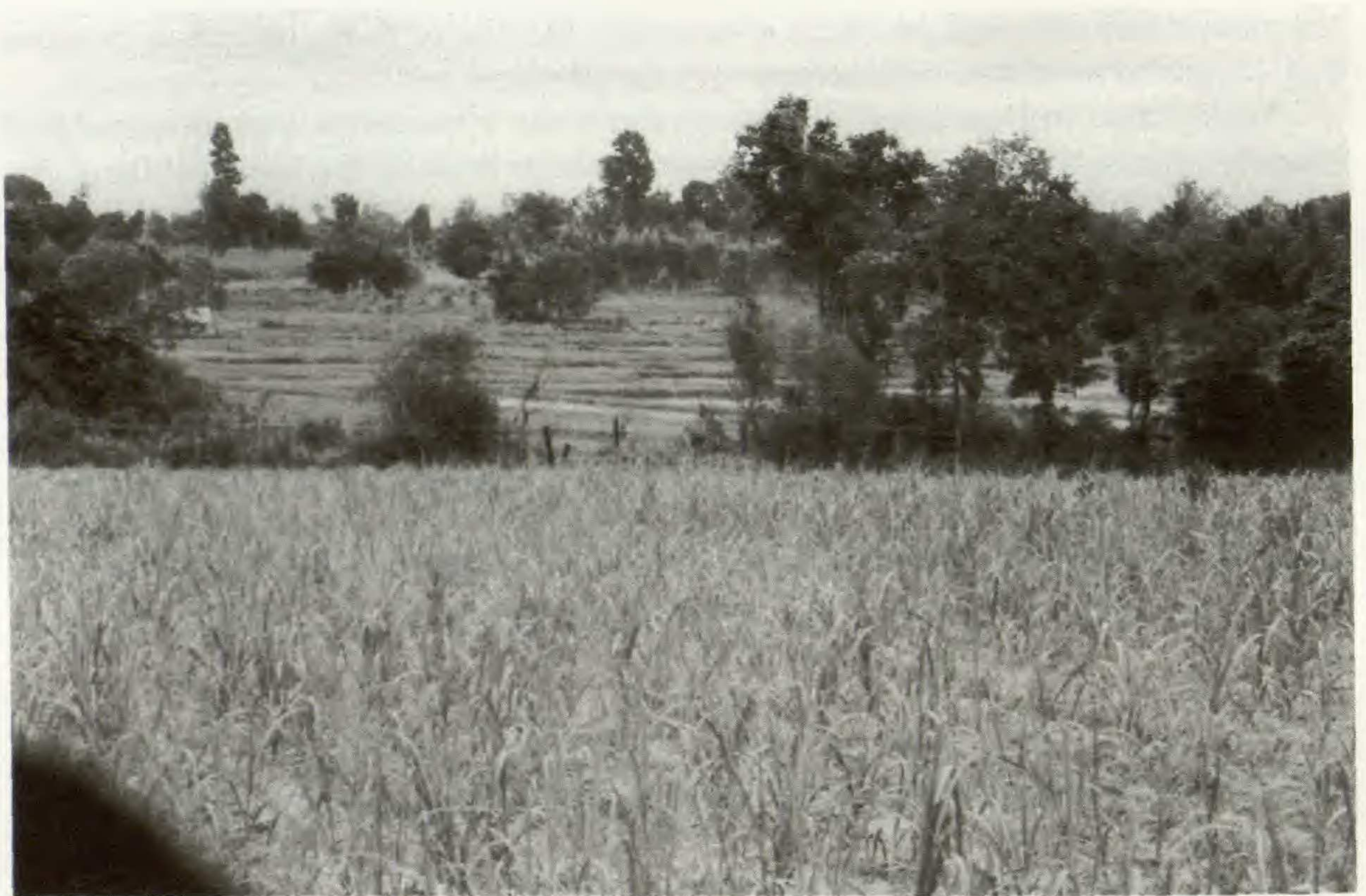
FIGURE 1.—The landscape surrounding the village. Paddy fields (background) and sugar cane cultivation area (foreground).

crops with large inputs from wild food (Moreno-Black 1994; Phongphit and Hewison 1990; Pradipasen et al. 1986; Somnasang et al. 1988; Tontisirin et al. 1986). Isan people have a great deal of traditional knowledge concerning the environment, wild plant and animal resources. They are also knowledgeable about predicting climatic patterns, cropping practices, green manuring, and energy extraction (Rambo 1991).